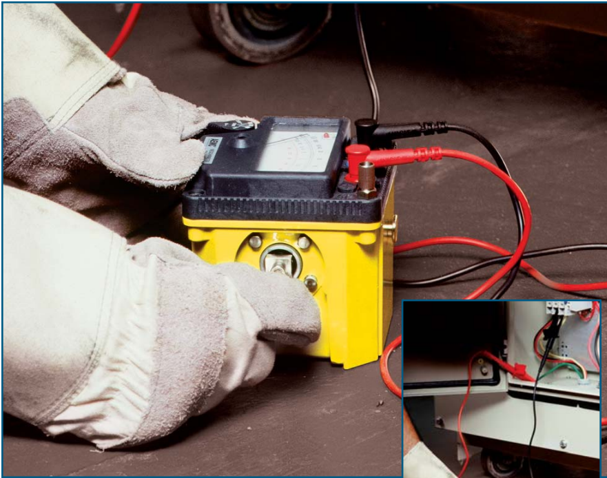
Model 1250N performing a hand-cranked 1000V test on a generator.

The AEMC® Models 1210N and 1250N are compact, self-contained, hand-cranked True Megohmmeters®. These practical and dependable instruments are designed for a broad range of plant and field service applications, such as acceptance testing and preventive maintenance of wiring, cables, switchgear and motors. The easy hand-cranked operation provides a steady, DC voltage output across the entire range for consistently reliable readings. In addition to insulation resistance testing at 500V, the Model 1210N also permits resistance testing to 500kΩ and continuity testing to 100Ω. The 600V test voltage range is to perform safety checks to confirm that the sample is fully discharged and not connected to an energized circuit. The Model 1250N has three test voltages for insulation resistance testing: 250V, 500V and 1000V. Test voltages are generated in full across the entire measurement range.