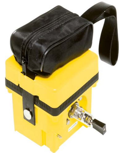
Detachable soft carrying case. The case attaches to the carrying strap.