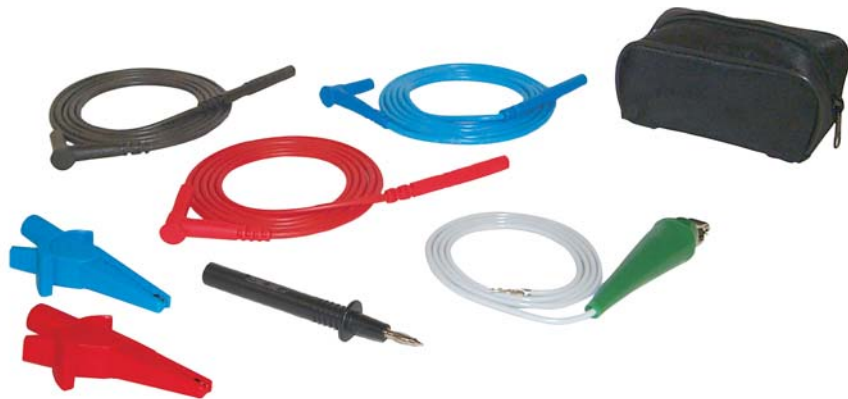
Test leads, clips and test probe are included